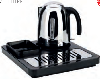
REGAL 2200W | 1 LITRE

Our range provides this facility safely, reliably and hygienically, with each manufactured for durability and lasting good looks. They are all supported with long guarantees, a reassurance that we're sure you'll find most welcome!